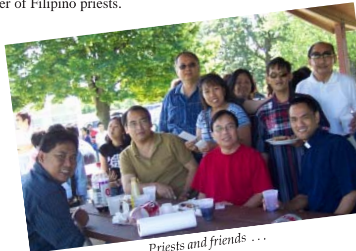
Priests and friends ...