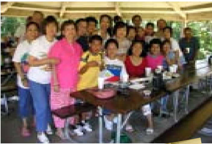
And the gang . . .