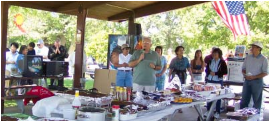
Blessing of food ...