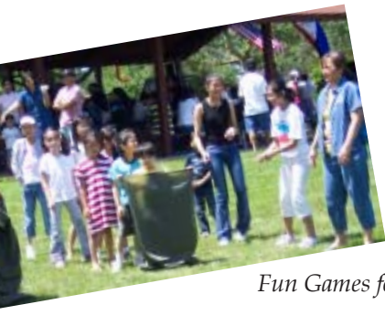
Fun Games for Kids . . .